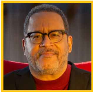
DR. MICHAEL ERIC DYSON Professor & Author