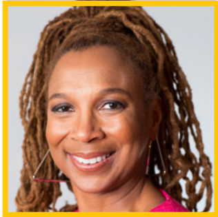
PROFESSOR KIMBERLÉ CRENSHAW Co-Founder & Executive Director African American Policy Forum

CRITICAL RACE THEORY: What It Is, What It Ain't ... Can We Simply Tell The Truth!