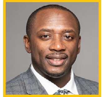
DONALD RENCHER Group Executive City of Detroit Mayor's Office